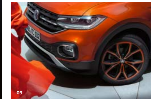
03 The 18-inch Köln alloy wheels in Hot Orange for the new T-Cross Style provide a splash of colour that simply refuses to be ignored. SO