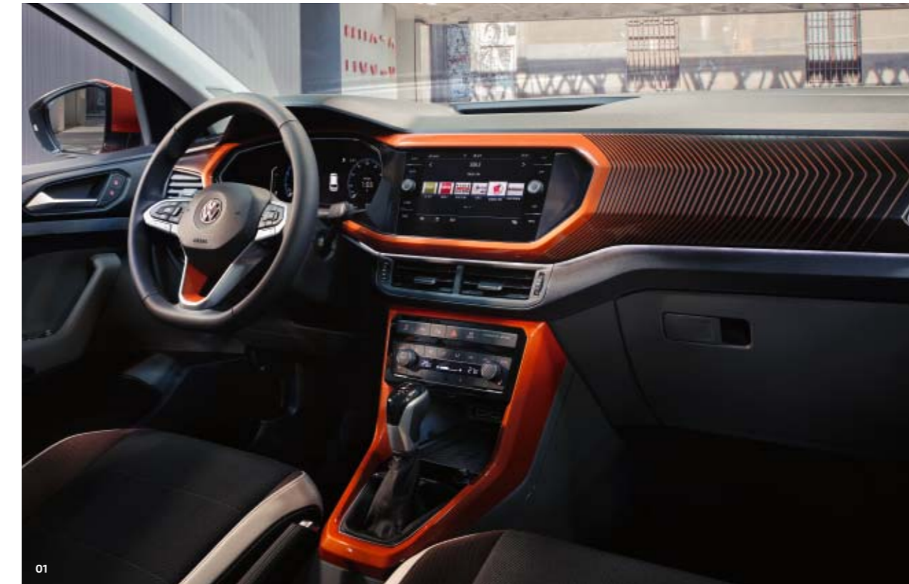
01 A real eye-catcher: The Transition décor with 3D design in Energetic Orange and Grey is an arresting design highlight. SO

Take advantage of the optional Energetic Orange design package and make your new T-Cross Style even more dazzling. It's the perfect option for those who make no compromise when it comes to individuality or character. Be bold! It can be grey out there on the road – but you don't have to be. SO